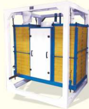
PLAN SHIFTER 2X12