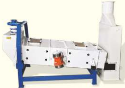
VIBRO SEPARATOR (DOUBLE DECK)