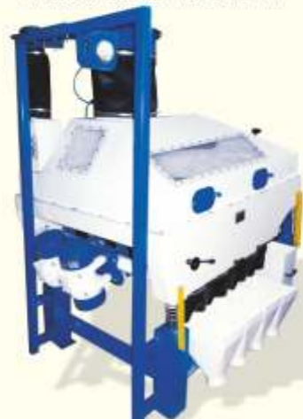
GRAVITY TABLE (MAIZE GERM SEPARATOR)