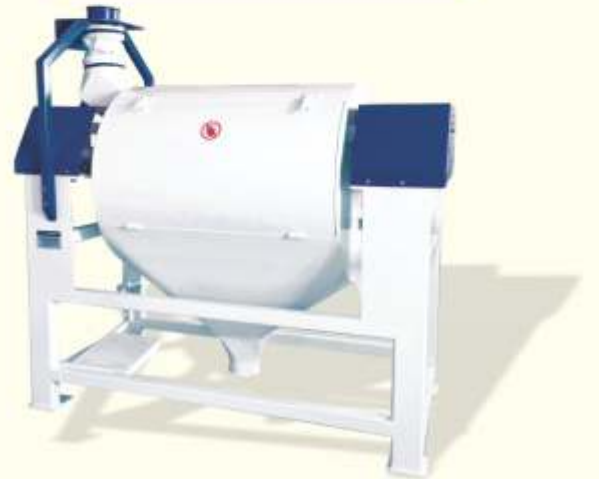
VIBRO BRAN FINISHER