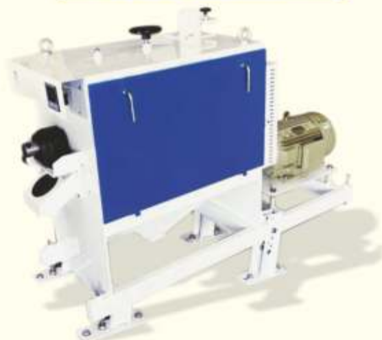
BRAN REMOVER (NEW MODEL)