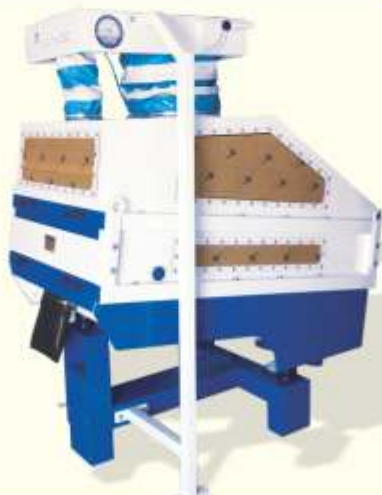
DE-STONER (DOUBLE DECK)