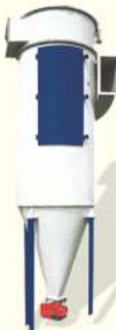
REVERSE AIR BAG FILTER