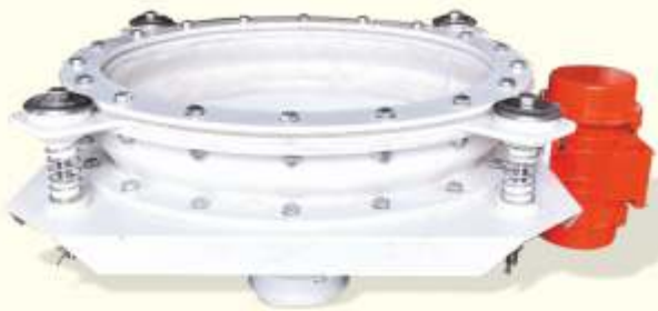
VIBRO BIN DISCHARGER