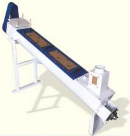
DAMPENING UNIT PADDLE TYPE