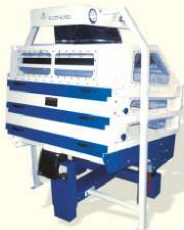
DE-STONER (TRIPLE DECK)